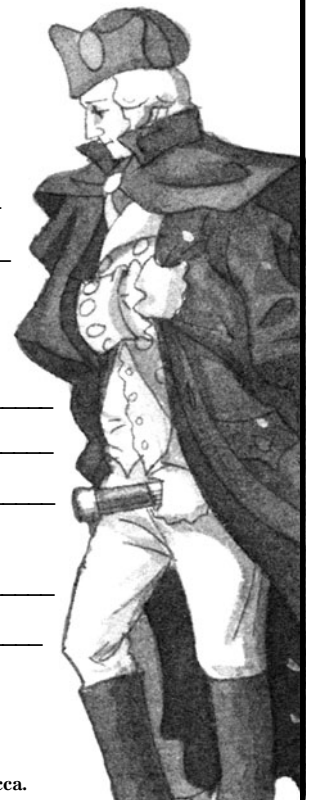
Illustration © 2000 by Sal Murdocca.

To read all the books in the Magic Tree House series, visit your local library or bookstore.