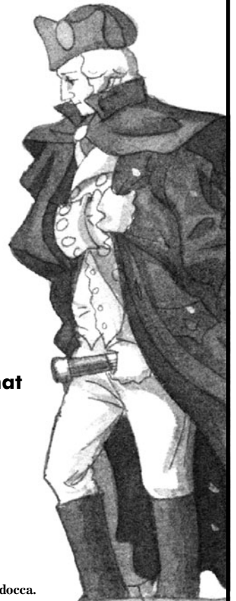
Illustration © 2000 by Sal Murdocca.

To read all the books in the Magic Tree House series, visit your local library or bookstore.