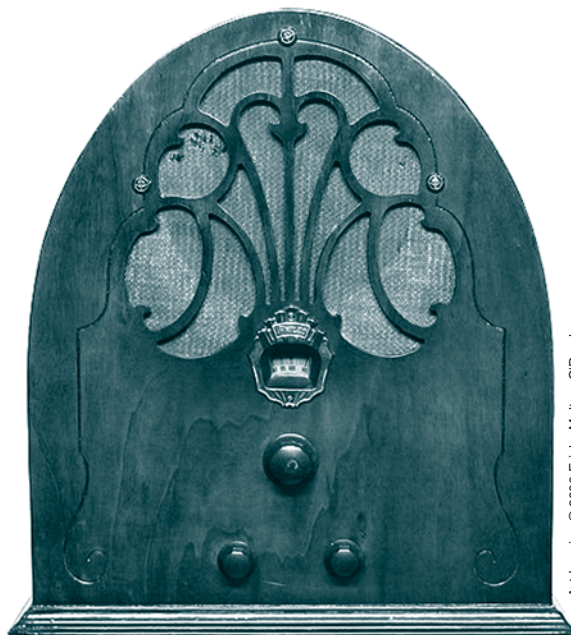
Art Imaging © 2006 Ericka Meltzer O'Flourke.