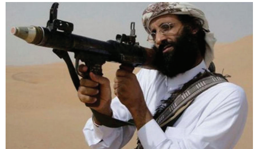
Anwar al-Awlaki's main role with Al Qaeda was as an ideologue and propagandist, and he was by far the terrorist network's most effective English-language recruiter. He often posed with weapons, like the rocket-propelled grenade launcher, to dramatize his call for violent jihad.