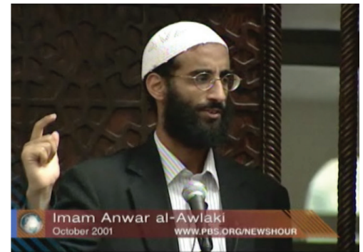
Anwar al-Awlaki preaching at Dar al-Hijrah mosque in Falls Church, Virginia, a Washington suburb, where he was the imam in 2001 and early 2002. He condemned the 9/11 attacks and took a conservative but mainstream line.