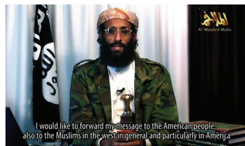
Anwar al-Awlaki delivering his most explicit call for attacks on America and Americans, in a video recorded in March 2010 in Yemen. He argued that it was every Muslim's religious duty to carry out such attacks.