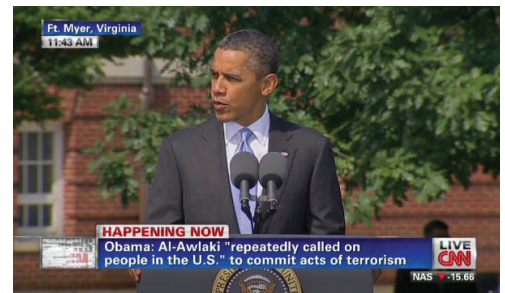
President Obama announces the death of Anwar al-Awlaki in a drone strike in Yemen on September 30, 2011. He had ordered Awlaki, an American citizen, killed after a secret legal review.