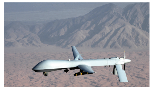
The Predator drone became the main weapon the United States used against suspected terrorists in Pakistan and Yemen. President Obama thought it was the way to counter Al Qaeda without endangering American troops or invading countries. But poor intelligence led to civilian casualties and the drone program sparked a major backlash.