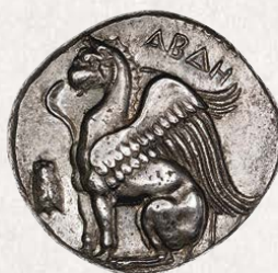
A Greek coin, ca 490 B.C., shows a cicada and a griffin.

Put all the creatures on display in your classroom, hallway, or school library. Have the class select one of the creatures to become the class mascot or protector. Create a logo based on the chosen one; make posters, T-shirts, flags, etc.