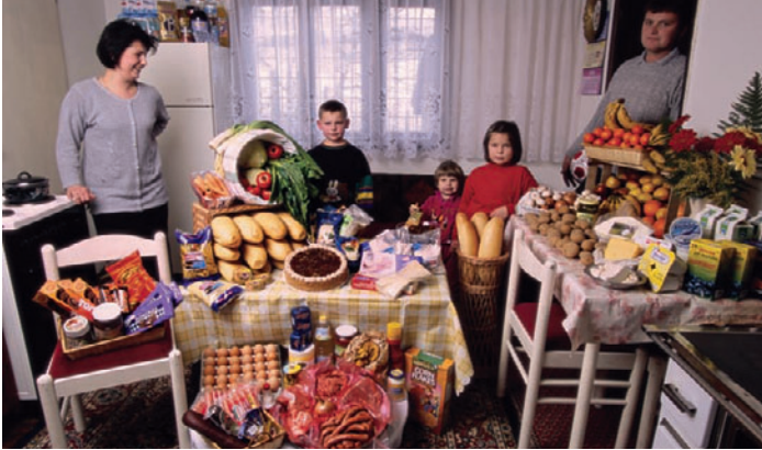
Photograph by Peter Menzel, from What the World Eats