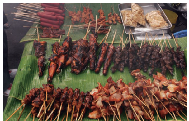
Photograph by Peter Menzel, from What the World Eats

Over 150 countries observe World Food Day annually on October 16. A different theme is chosen each year; you can look up this year's current theme online. Create posters that promote awareness of World Food Day and hang them throughout your school. Or write a speech about the meaning and importance of the day that could be delivered to a class or school assembly.