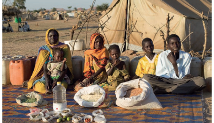
Photograph by Peter Menzel, from What the World Eats