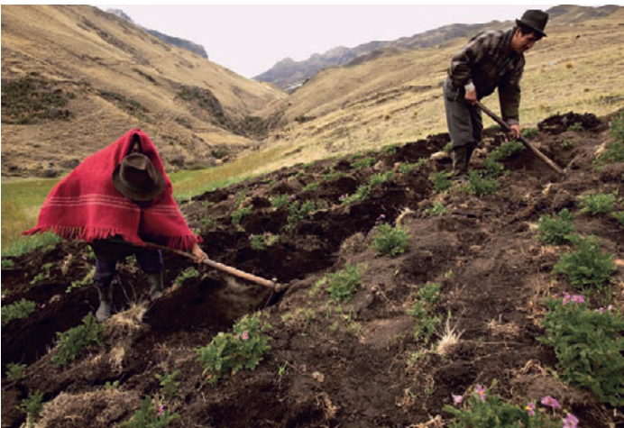
Photograph by Peter Menzel, from What the World Eats

http://www.edibleschoolyard.org/homepage.html — Students learn how to grow, harvest, and prepare nutritious seasonal produce, making the connection between what they eat and where it comes from.