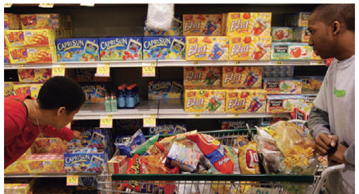
Photograph by Peter Menzel, from What the World Eats

Go grocery shopping with a parent or other adult and keep track of the food bought for the week. Make a list of foods purchased, the amount and cost, organizing the foods under the same categories used in What the World Eats . Include food from the garden, fast food, and food eaten in restaurants. How does your family compare with the U.S. families included in the book?