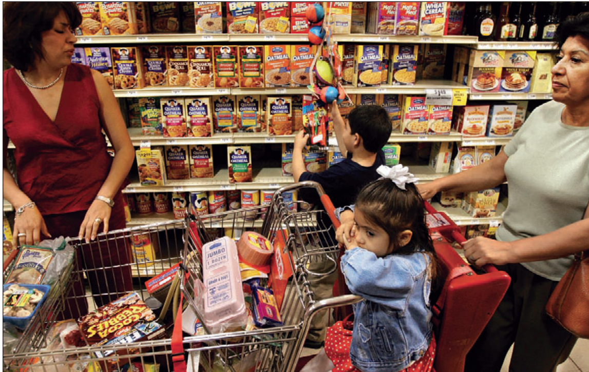
Photograph by Peter Menzel, from What the World Eats

Stunning photographs show readers what people of the world eat in portraits of twenty-five families from twenty-one countries surrounded by a week's worth of food, documenting a fascinating exploration of comparative world nutrition. For their study, Menzel and D'Aluisio spent time with typical families in each country, discussing their eating habits, calculating a week's worth of food purchases, and accompanying families to the marketplace to document local customs and traditions. About so much more than food, this book offers fertile ground for the examination of the expanding global food economy, world hunger, current events, sustainable agriculture, and cultural similarities and differences.