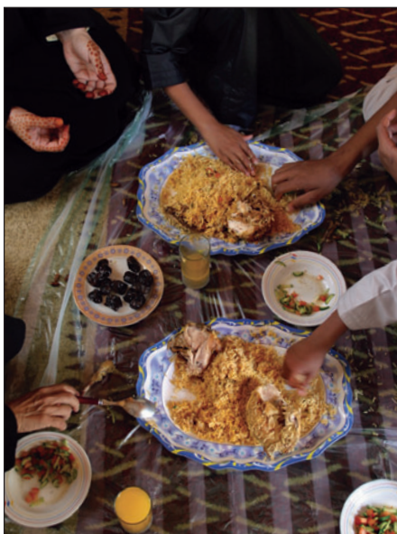
Photograph by Peter Menzel, from What the World Eats