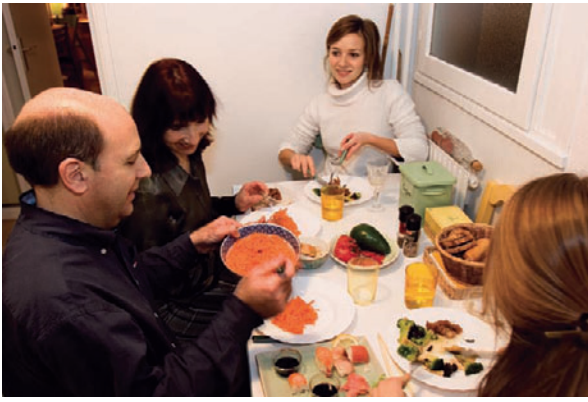
Photograph by Peter Menzel, from What the World Eats