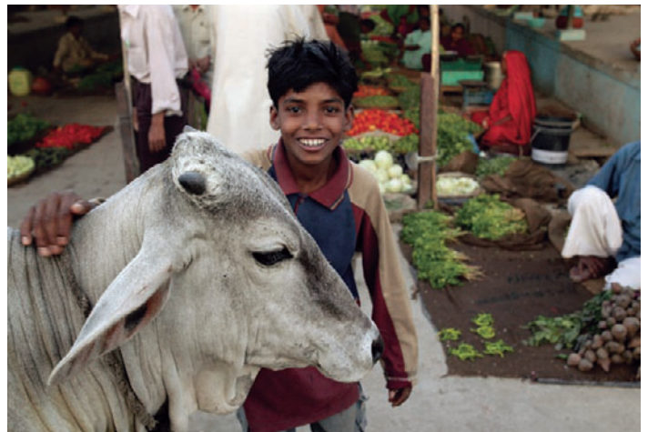
Photograph by Peter Menzel, from What the World Eats