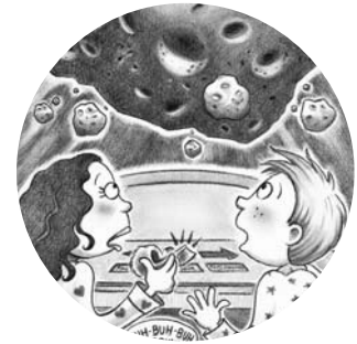
Illustration © 2004 by Jan Gerardi.

e a r t h x y i o m s p s u n w v r o c k r c p l c n o d k o p l a n e t x e w q c m a r s h m e r c u r y s t e h s a t u r n x b y w q z s t a r s c v h z j u p i t e r n b m h r p o w u r a n u s x m c n e p t u n e y u r p i m o o n x v t u z s p a c e y w c o m e t z q