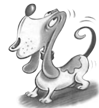
Illustration © 2002 by Debbie Palen.

___ space ___ comet ___ Saturn ___ Mercury ___ stars ___ Neptune ___ moon ___ planet ___ Mars ___ rock ___ Jupiter ___ sun ___ Uranus ___ Earth