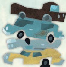
Junk yard cars