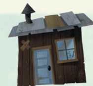
Junk yard house