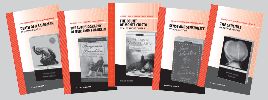
A full list of Teacher's Guides and Teacher's Guides for the Signet Classic Shakespeare Series is available on Penguin's website at: us.penguingroup.com/tguides