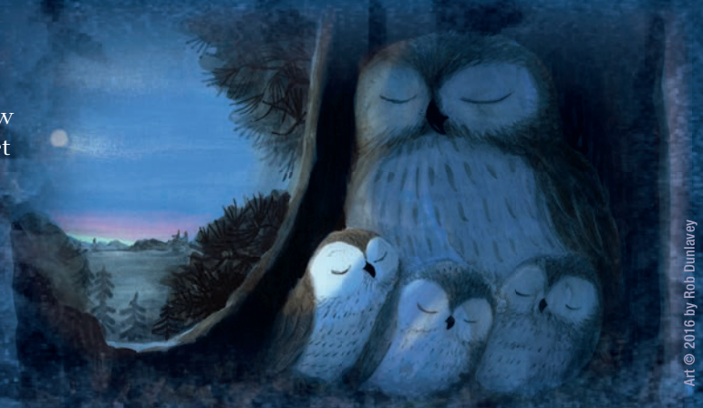
Art © 2016 by Rob Dunlavey