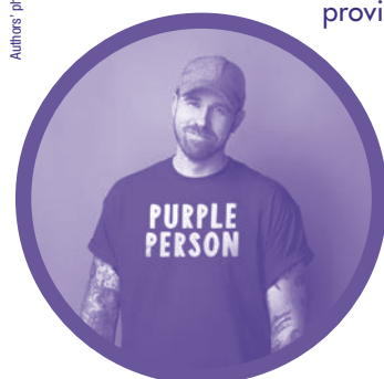
Authors' photo courtesy of the authors.