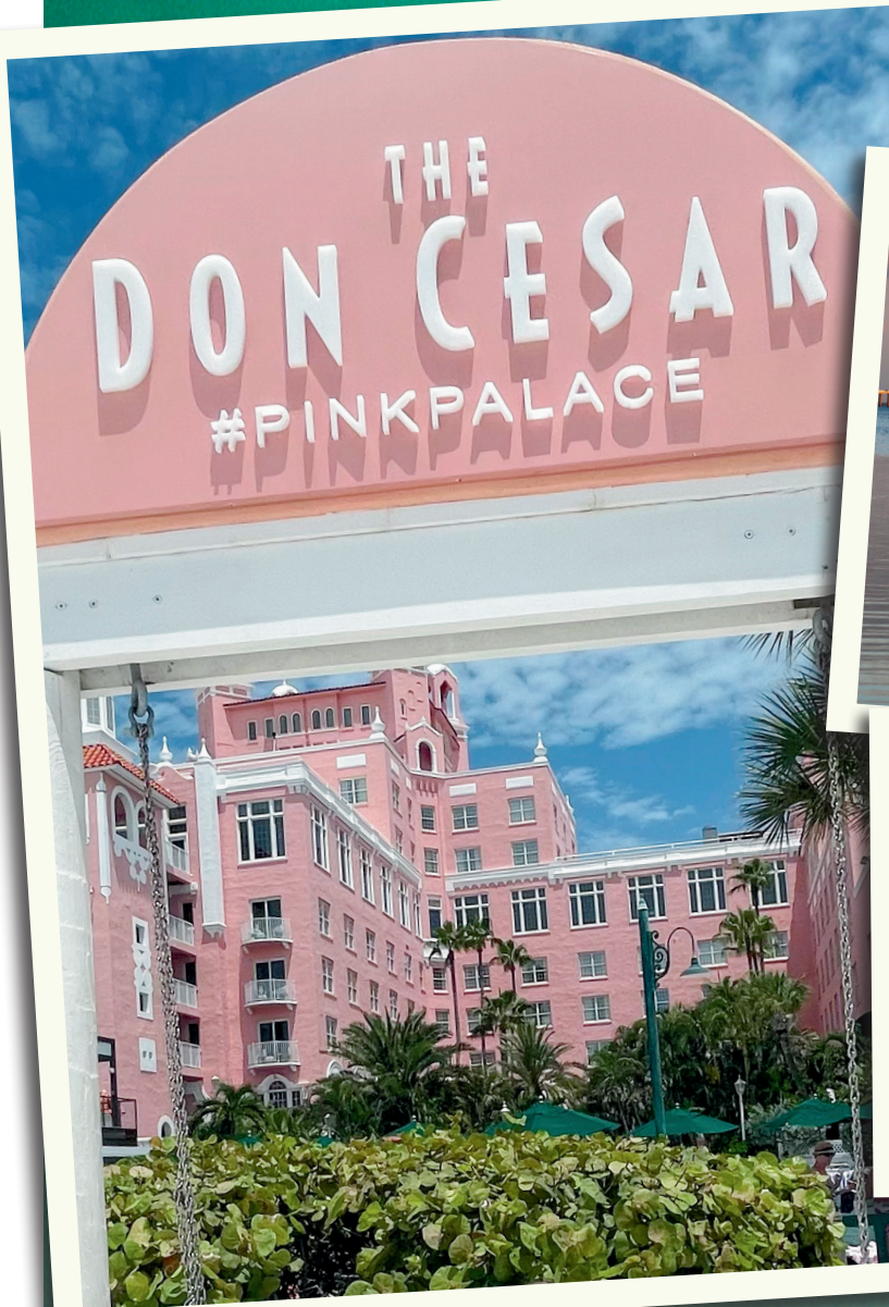
The Don CeSar