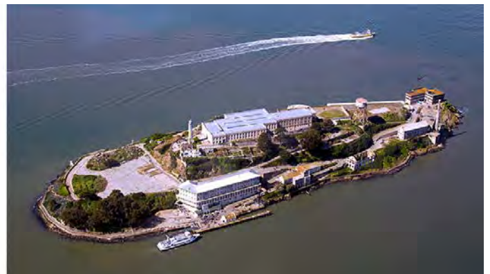
Alcatraz (under Creative Commons license, Attribute:ShareAlike)