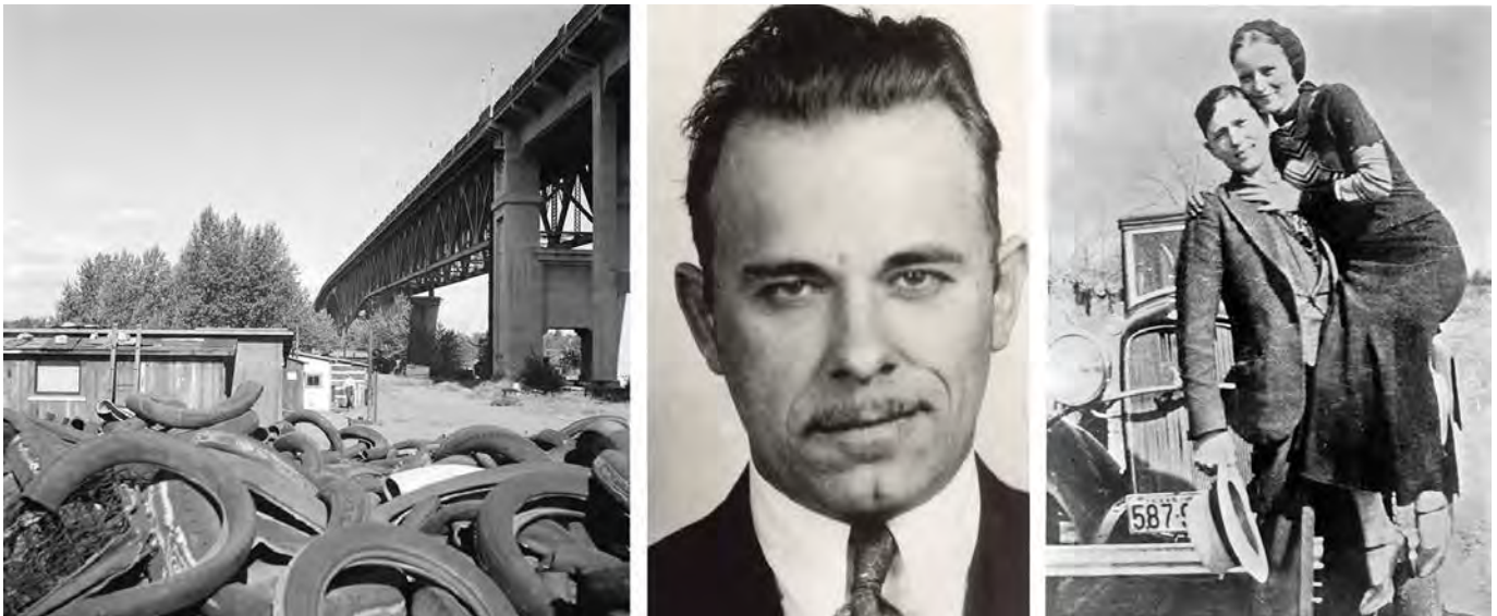
Hooverville • John Dillinger • Bonnie and Clyde