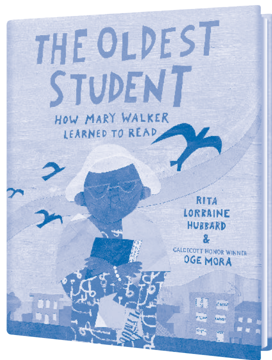
By Rita Lorraine Hubbard Illustrated by Oge Mora